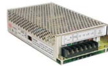
24V DC Power Supply