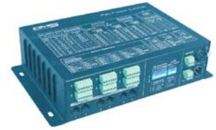
Ray Power Control